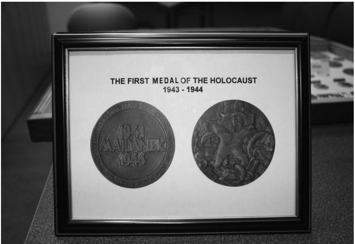
The earliest medal commemorated the Holocaust.